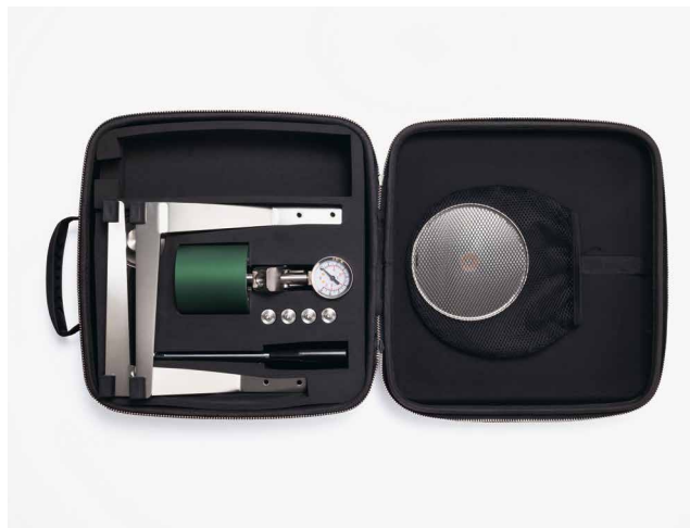
3 – Mina in a handy travel case